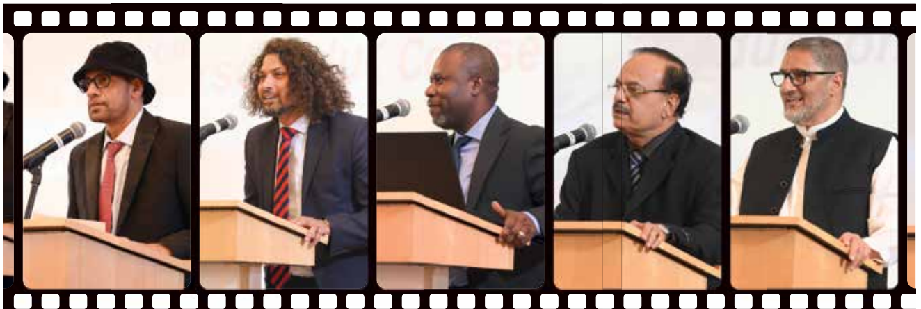
The Keynote Speakers of the event