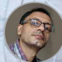
Gemal Riyaz Design and Layout