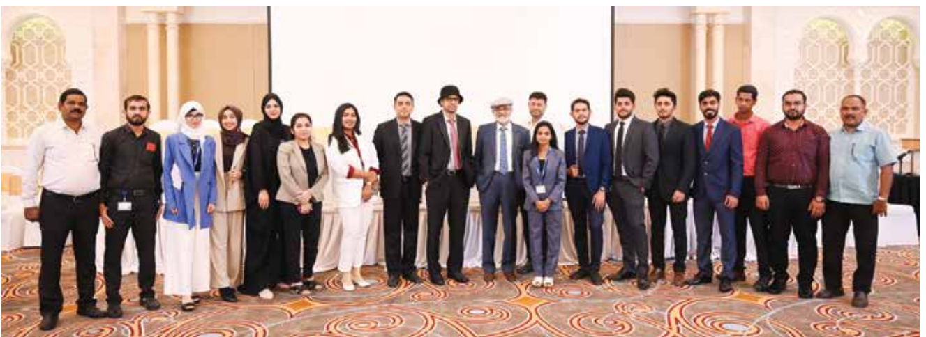
Professional Services Team with the Senior Management