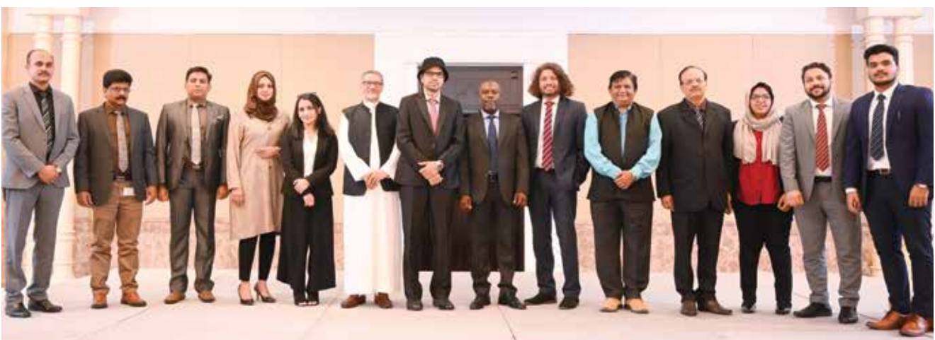
Faculty of Business and Management with the CEO and Academic Dean