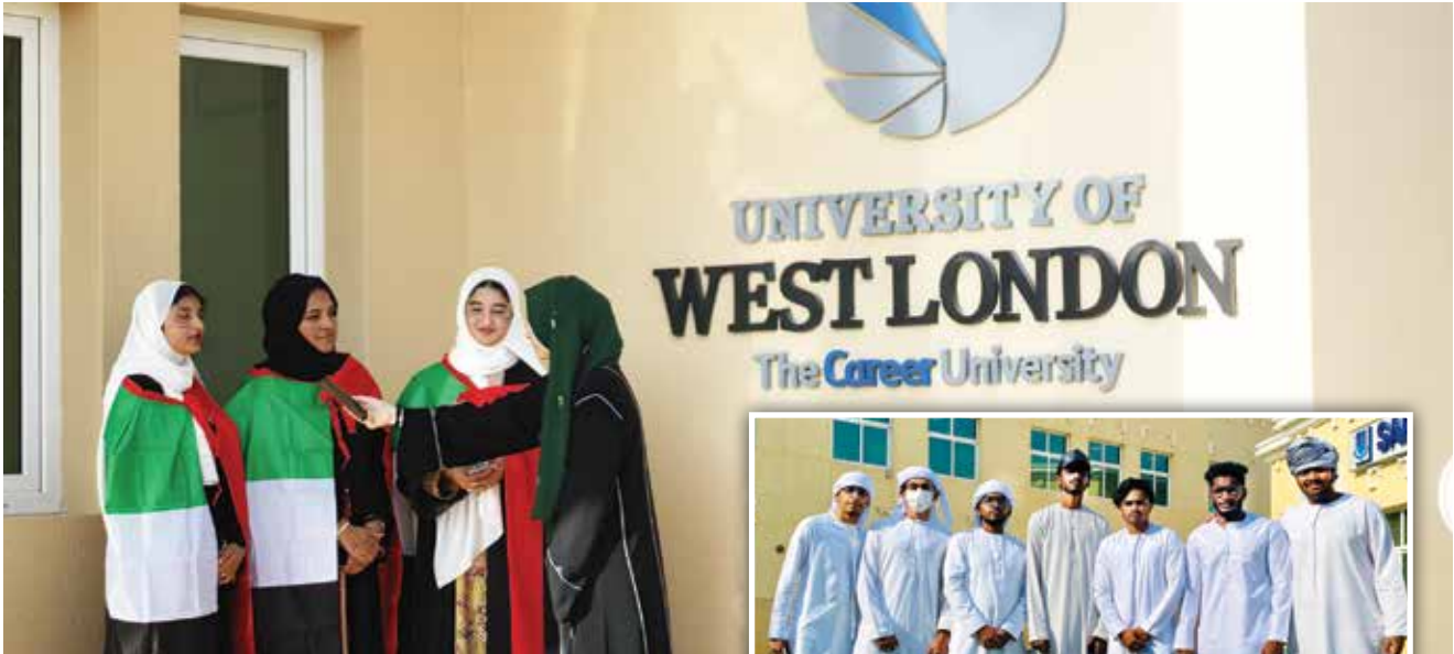
UWL RAK joined the nation in celebrating the UAE Flag Day with pride.