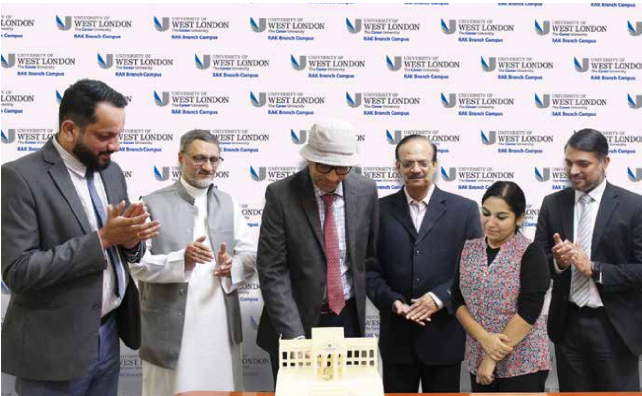
UWL celebrated its birthday with a cake-cutting ceremony, raising a toast to past glories and looking forward to future achievements. Wishing UWL many more years of unparalleled success. Happy 5th Anniversary!