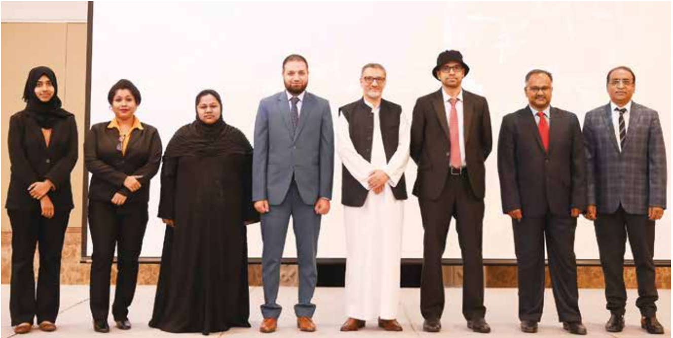
Faculty of Computing and Engineering with the CEO and Academic Dean