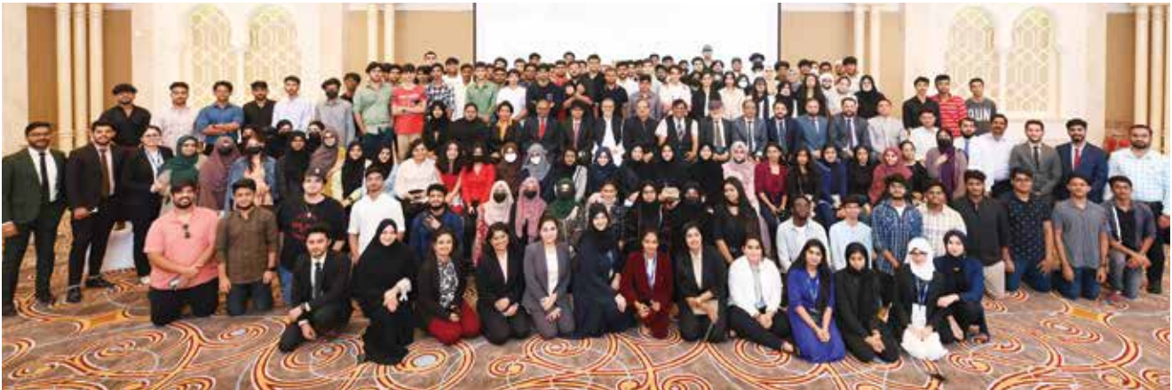
Induction Ceremony of Computing and Engineering Students