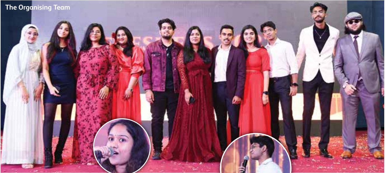
The Organising Team

The Fresher's Day organised by the Student community witnessed an array of jaw dropping performances by dancers, singers, musicians - you name it, we had it! The organizing committee of UWL's Fresher's Day, please take a bow!