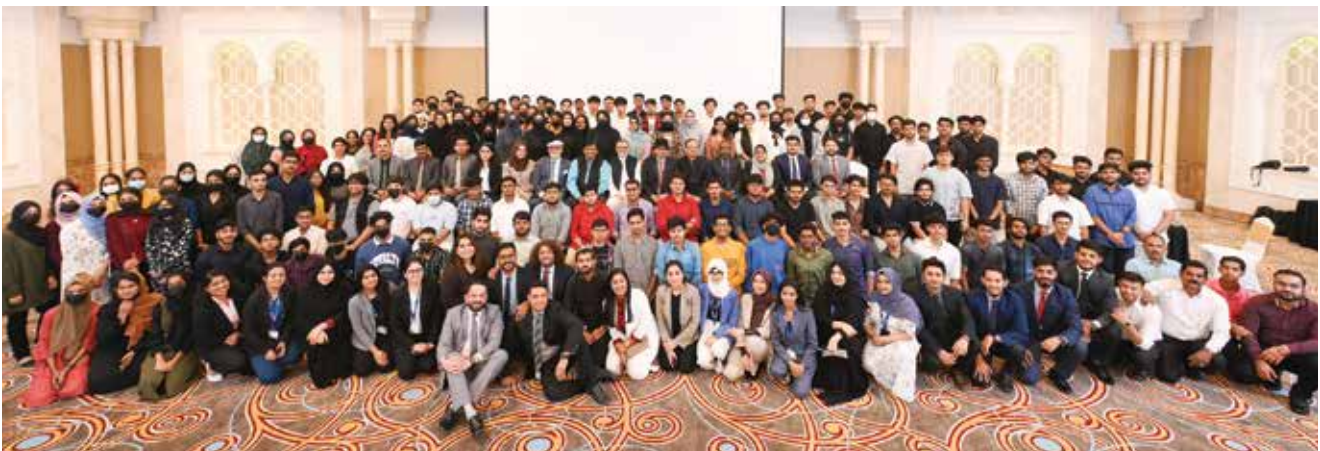
Induction Ceremony of Business and Management Students